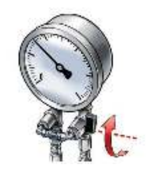
Close bypass and read pressure and process with flow indicator